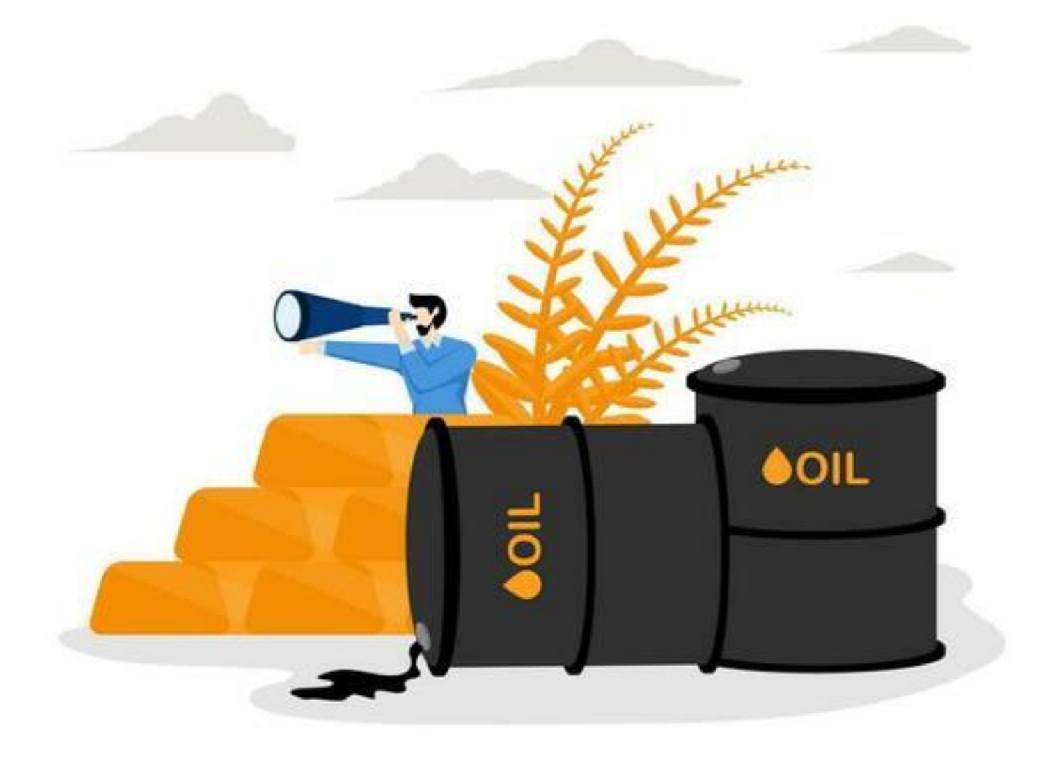
Commodities Evening Wrap